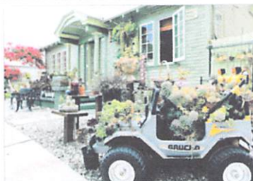
Ventura Cactus & Succulents in Ventura has thousands of the plants on display in the front yard and backyard of a residential property.